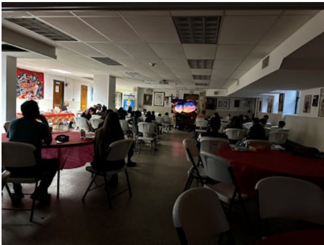
Movie Knight with the ICC Youth Group