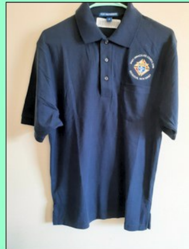
#1143 Pocket Polo Shirt

We still have some pocket polo shirts. They are priced at cost!!! Contact Charlie at cell: 201-803-9217. or www.kofc12769.org/pro_shop.htm